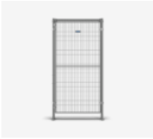
SINGLE HINGED DOOR