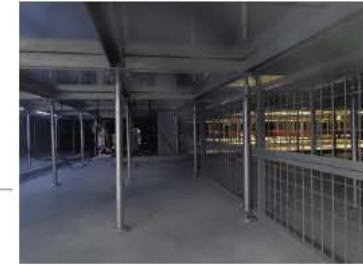
An example of mesh infill between the building floor and the computer floor.