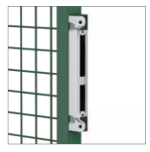
Universal gate catcher made out of Aluminum