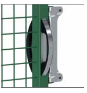
Aluminum Handle pair for double swing gates