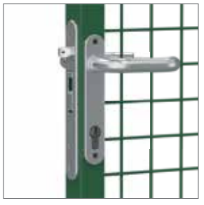
Stainless steel built in lock with lock plate and Aluminum handles