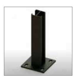
Separate footplate to allow installation on footplate