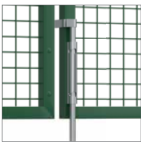
Ground bolt and holder for double swing gates

Europe Blokkestraat 34b B-8550 Zwevegem Tel: B: +32 56 73 46 46