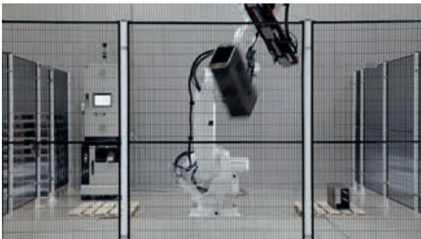
Real impact test using an ABB robot with magnetic gripper that ejects a steel tube of 52 kg into the Smart Fix machine guard.

- The risk assessment shall provide information on how much impact resistance the machine guard shall withstand.